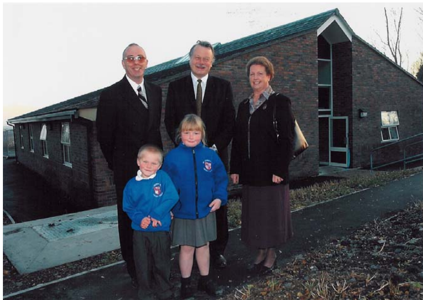
Above: Opening new classroom block at St George's Primary, Church Gresley

St George's Primary School Investment in our local schools was neglected for many years. We have started to make real progress. The star event this year was the opening of a new classroom block and refurbishment at St George's, Church Gresley. This allowed the removal of a "temporary classroom" from the small playground and the return of the front-room of a neighbour's house.