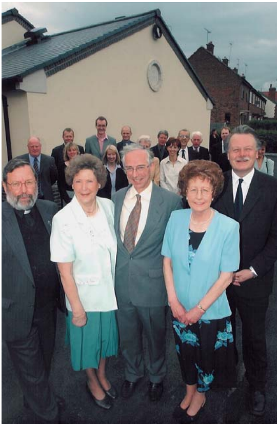
Right : Opening the new Jubilee Community Hall in Hatton.

The new Church Hall at Hatton opened in 2003 offering space for a play group, other local services and a modern hall. I have been involved at various stages of these projects and am delighted to see local effort rewarded.