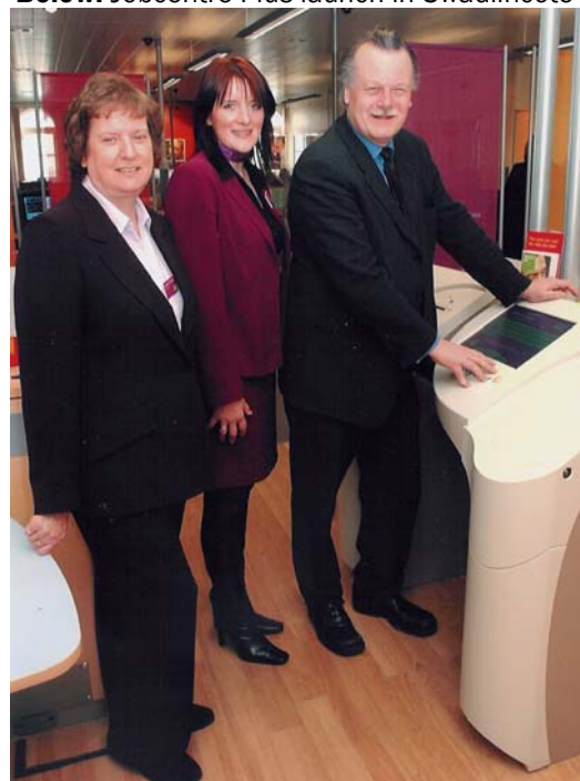
Below: Jobcentre Plus launch in Swadlincote

I lead the group that brings together MPs, officials and Union representatives to monitor the handling of local coal health claims. While there is a lot still to do, to date over £8.2 million has been paid out to former mineworkers and their families in South Derbyshire . If you're having problems with a claim please get in touch.